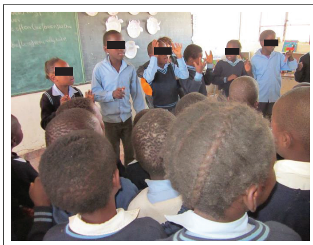
FIGURE 2: Interactive concert that took place at the end of the project including the entire school.

All sessions shared a similar format: greeting, singing previously learnt songs and a quiz about previously-learnt vocabulary. After the revision, a new song was learnt and repeated several times with a focus on linking subject content, art elements and principles as well as vocabulary. To assist with vocabulary, pictures were sometimes used as additional resources. A variety of percussion instruments were used in different combinations as song accompaniment. New vocabulary was added to the word wall and then followed by an art activity and/or completion of a worksheet. At the end of each session, the new song was repeated. Some educators often came in to join the lessons.