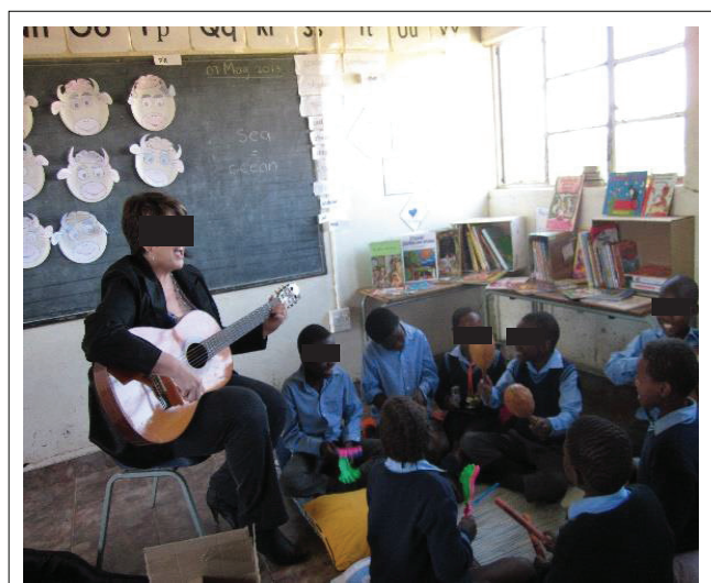
FIGURE 1: Singing time during one of the sessions where learners worked with percussion instruments.